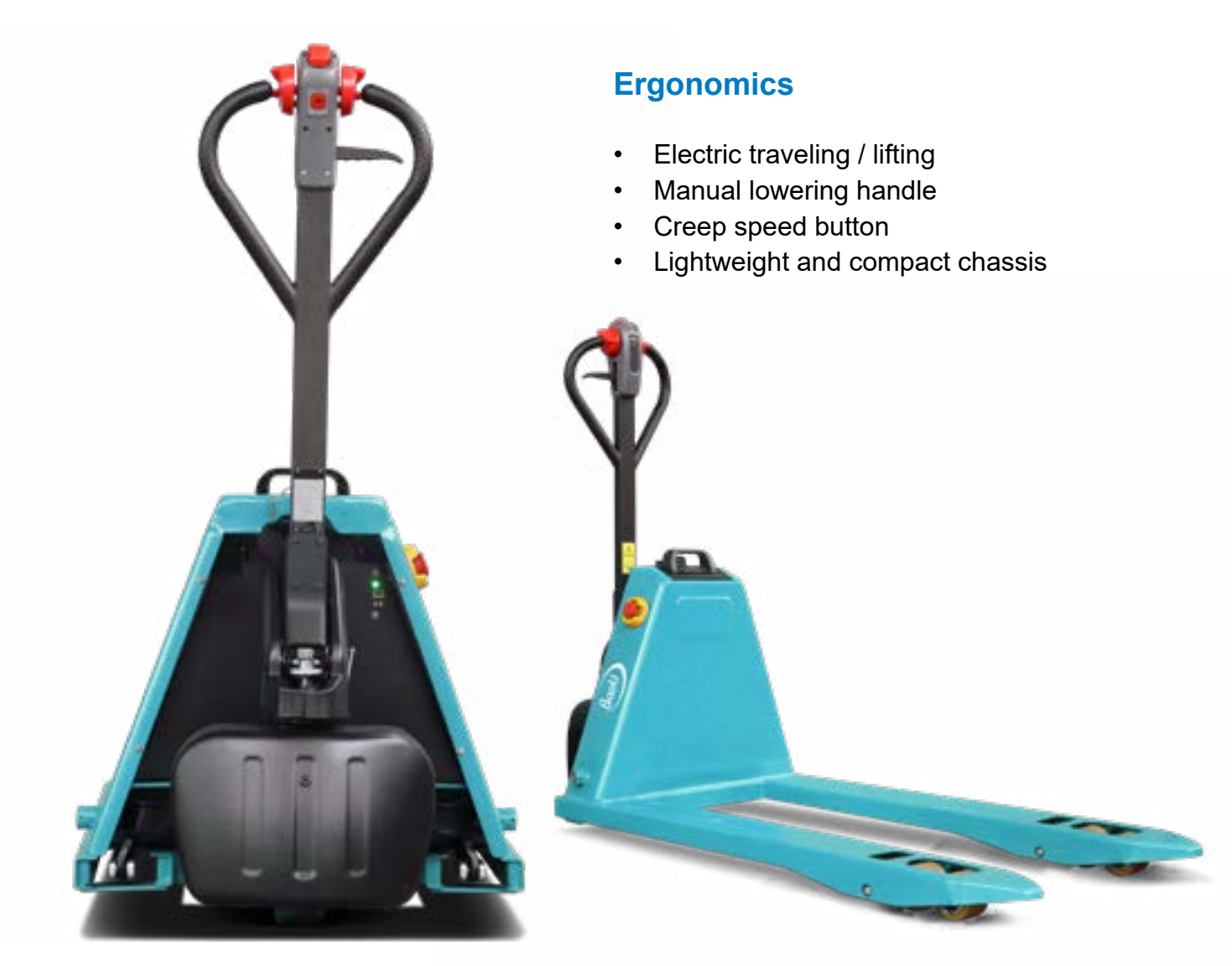
All controls ergonomically integrated in the Baoli tiller head

NOTE: The performance depicted represents nominal values obtained under typical operating conditions. Performance data may vary due to motor and system efficiency tolerances, and under different working conditions. The description and specifications included on this data sheet were in effect at time of printing. Linde Material Handling Pty Ltd reserves the right to make improvements and changes in specification or design without notice and without incurring obligation.