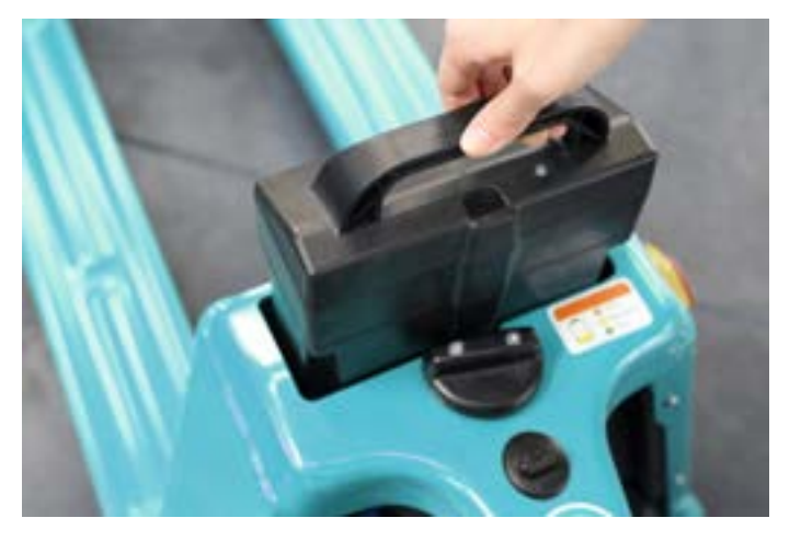
Easy plug and play Li-ION battery